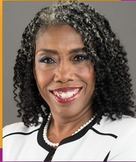
President & CEO African American CU Coalition

Serving as President & CEO of the African-American Credit Union Coalition (AACUC) she is responsible for the execution of the strategic vision of the Board of Directors. With over 30 years in the world of finance, she started her career as a teller trainee for City National Bank in Beverly Hills, California. She has been associated with credit unions for over 25 years.