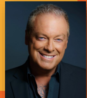
TV Personality & Author

Daytime Emmy-Award winning TV personality Todd Newton is often referred to by industry insiders as "The Host with the Most" ®. Newton's amiable persona on E! Entertainment Television brought viewers in more than thirty countries face to face with Hollywood's elite for over a decade. He has awarded contestants over thirty million dollars in cash and prizes on numerous game shows. For over 20 years, Todd has been host of The Price Is Right Live! a live stage version of the TV game show classic.